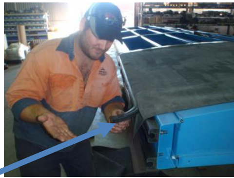
FLEXIBLE LOCKING STRIP

ENCAPLOCK ELIMINATES WELDING TO SIDE PLATES AS TRACK INCORPORATES FIXING STUDS